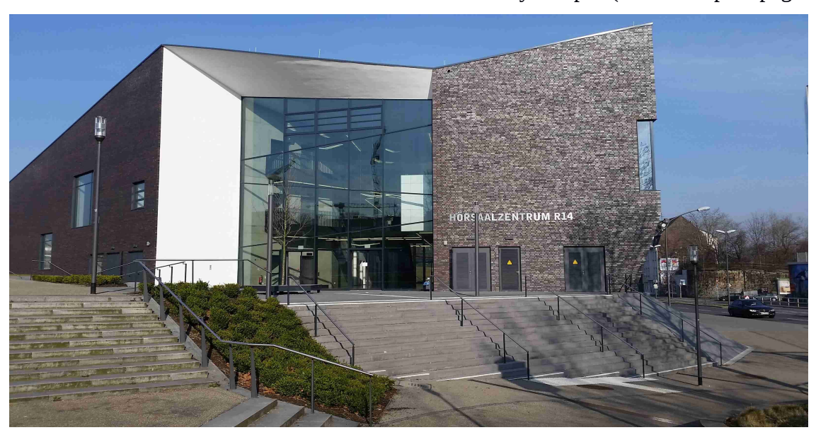
It is a 20-minute walk from the hotel. Note that this is <u>not</u> the math department!

All talks and the coffee breaks take place in the lecture hall building called "Hörsaalzentrum R14". It is located south of the university campus (see the map on page 5).